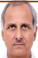
Dr. KK Narayanan